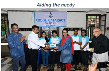
Aiding the needy

For the past several years, Lodge Cataract 909 SC has always celebrated the Universal Brotherhood Day in an apt manner by organizing various charitable drives in and around the city of Belgaum. This year it had reportedly organised a grand function on the occasion of Universal Brotherhood day and donated six wheel chairs to specially challenged children from rural areas surrounding Belgaum. In addition, they also donated a laptop, a mobile smart phone, a mobile selfie stick, etc., to Ashray Foundation, (an organization taking care of HIV effected girls) totally worth Rs. 1,00,000/-.