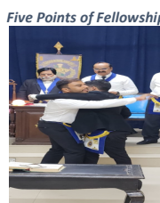
Five Points of Fellowship