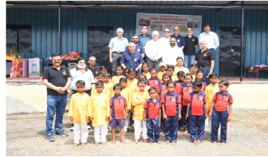
Distributing Uniforms for the children

As we departed after a satisfying charity drive, we were left pondering at the commitment to social service of the couple managing the show. The immediate thought that comes to our mind is that Productivity is never an accident; it is a commitment to excellence -- that will enable you to attain the success you seek. On the other hand, plans are only good intentions unless they immediately degenerate into hard work. Undoubtedly, some people look for a beautiful place; others make a place beautiful.