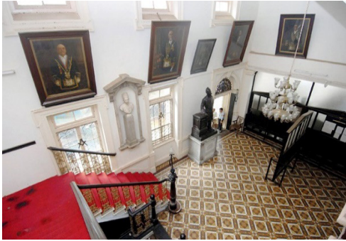
The main Foyer of Freemasons' Hall, Mumbai

Contagious Magic. It is also National Forgiveness Day which is appropriate for the Reconciliation between the Several Constitutions in India.