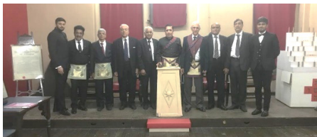
The Exaltees of Chapter Rising Star of Western India