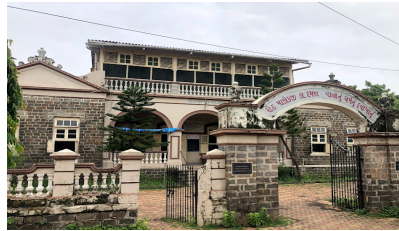
Damanwala Dispensary where Lodge meetings are now held