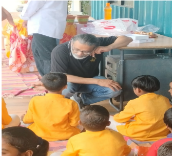
Amusing the children at the home