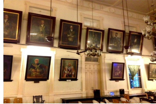
Portraits of eminent Masons overlooking the Hall

While working on the same principles, the Freemasons from across the country celebrated the Universal Brotherhood Day on 24 th June 2023, as they have been doing for the last several years. The Universal Brotherhood Day mainly aims to spread the message of peace and harmony amongst everyone. While a lot of people do not have any clue as to what Freemasons do as a society, they will be able to experience and understand how the organisation functions. The Freemasons' Hall at Mumbai has borne testimony to a number of celebratory events on 24 th June over the years.