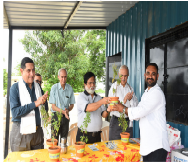
The host Gifting Tulsi plants to the visitors