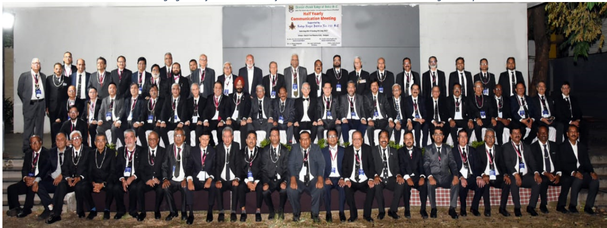
Congregation of Scottish Brethren from all over India who attended the meetings at Solapur