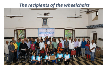
The recipients of the wheelchairs

The doles were handed over at a specially organised function arranged at Belgaum attended by around thirty brethren including Past Masters and about twenty invitees.